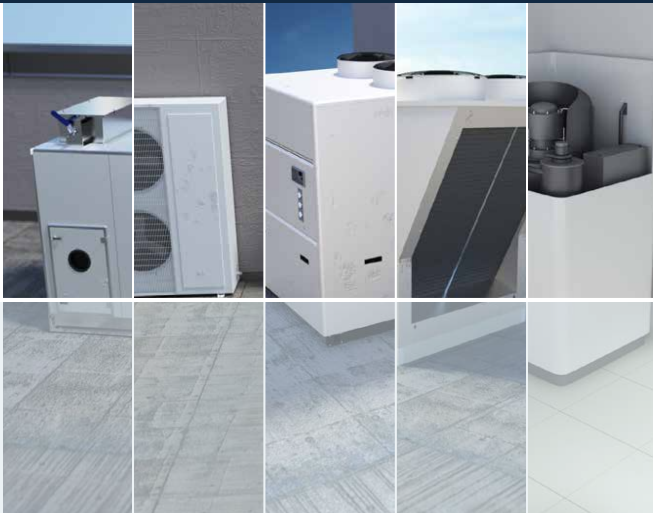
Air handling units