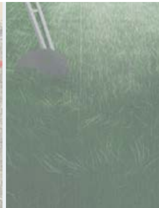
Tractors and agricultural machinery